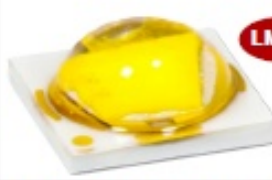
6 KLHP3535W 130Lm