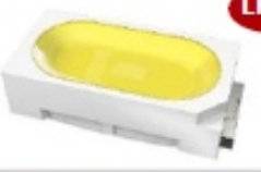
2 KLSSL3014W 12Lm