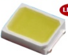
3 2835W 26Lm 65Lm