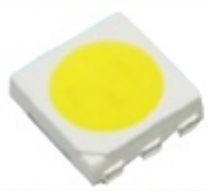
5 KLSSL505W 110Lm