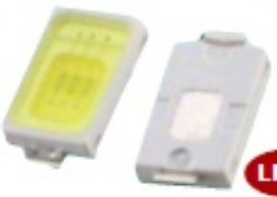
4 KLSSL5630W 60/65 Lm