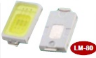
4 KLSL5630W 60/65 Lm