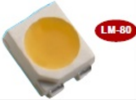
1 KLSL3228W 8Lm