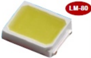
3 2835W 26Lm 65Lm