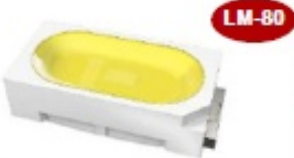
2 KLSL3014W 12Lm